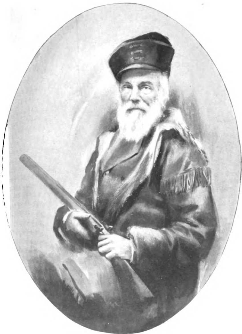
CAPT. JOSEPH REDDEFORD WALKER